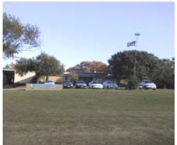
Opportunities In Tyler Campus North Loop 323

Goodwill Auctions are held every Tuesday & Thursday mornings at 8 AM. at 409 W. Locust Street, Tyler. Super Auction is held the last Saturday of every month at 1817 WSW Loop 323, Tyler, at 9 AM.